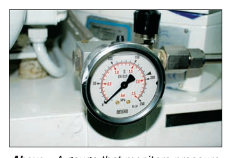
Above —A gauge that monitors pressure at the clean-fuel outlet of a centrifugal separator will sound an alarm; the feed pump will be turned off if pressure drops beyond a preset limit. Right —Many conventional primary fuelfilter designs include passive centrifuge elements capable of spinning out large particulate debris—but lacking the g-force of a true centrifuge.

single-digit micron or molecular form. Thus, despite the word centrifuge to describe one of the steps such filters employ for water and debris removal, there's little similarity between the