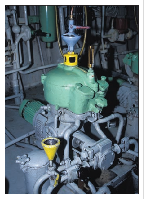
A 40-year-old centrifugal separator. It's still going strong aboard an expedition cruise ship that operates from Arctic to Antarctic waters, where fuel filtration is critical but the nearest spare filterelement may be thousands of miles away.

Is it that much better, more effective, and less trouble than a conventional filter to warrant the additional expense? I believe the answer may be yes, depending on the vessel's requirements. Where industrial filtration/separation technology is concerned, centrifuges are the last word in getting dirt and water out with the greatest reliability and least fuss and maintenance. If a vessel is equipped with especially large tanks, or if it's