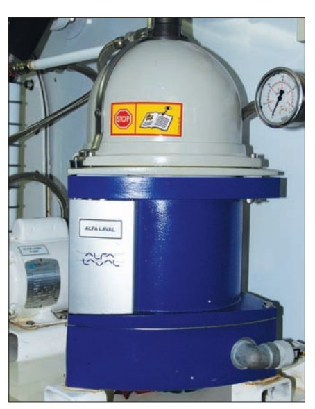
Centrifugal separators like this one (an Alfa Laval MB303) have few moving parts and often operate for thousands of hours with little or no maintenance.