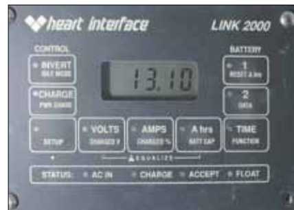
Left —All batteries (even the sealed type) that are stored aboard will require maintenance. Above —Battery banks and monitoring systems on deep-stored boats should be periodically inspected by a knowledgeable electrician. He or she should visually check connections, case condition, and voltage, and monitor temperatures while charging.

of time create condensation inside the hull as well as in equipment such as tanks, electrical enclosures, engine blocks, generators, and electric motors. In either of these climates, consider employing either stand-alone or fixed integrated dehumidifiers. Not all dehumidifiers can be left in an automatic mode when exposed to freezing or near-freezing temperatures, so make provisions for continuous, unattended condensate drainage. Permanently installed systems such as Dryzone ( www.dryzone.ca ) are designed to operate under virtually all storage conditions.