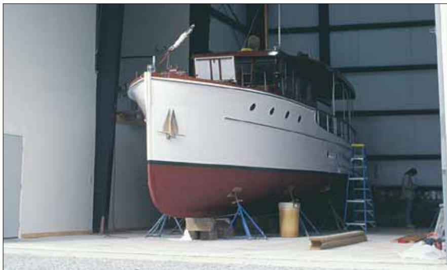
Boats stored under cover, or inside and in climate-controlled conditions, can be more easily and more frequently ventilated without concern for water ingress from deck, port, and hatch leaks. Wooden boats, of course, have specific needs all their own.

To establish the best plan, identify under what conditions the boat will be stored. Appropriate storage depends on the type of boat (wooden boats clearly have special storage needs), along with where and how