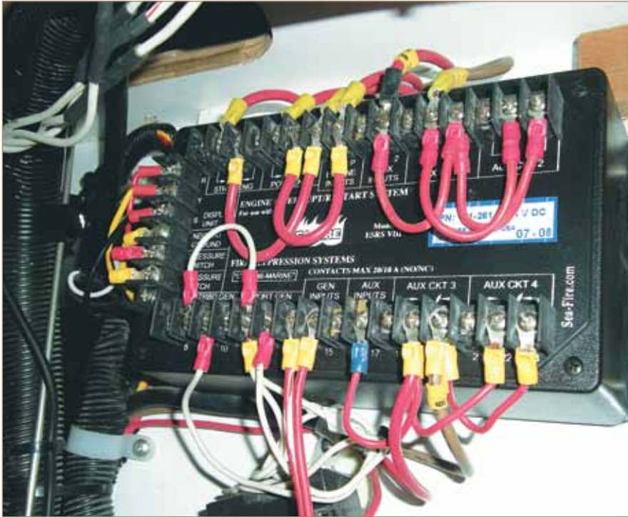
Optional FFE system relay controls shown here will automatically shut down gear such as engines, generators, and ventilation systems upon clean-agent discharge, whether it's manual or automatic. Relay controls are required for ABYC compliance in diesel-powered vessels, but are worthwhile additions to any system.

If the lamp isn't illuminated, then assume the system is not ready to be used.