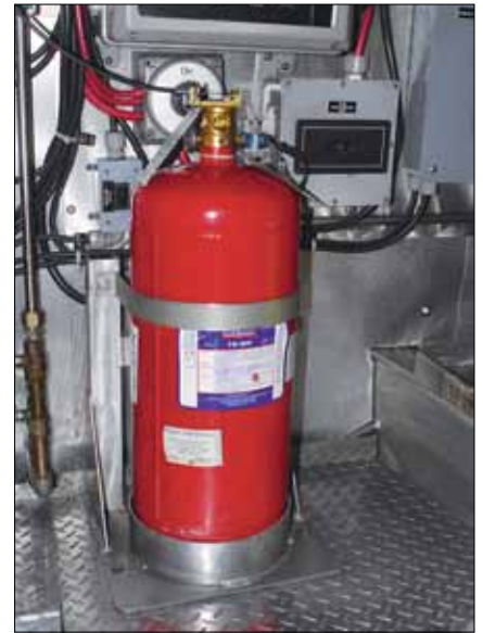
The FFE bottle is appropriately secured in a custom bracket. Ideally, the temperature-sensitive nozzle should be mounted as high as possible in a compartment and away from air intakes or forced ventilation.

and its temperature-sensitive trigger should be located as high as possible within the compartment, where the heat will trigger it quickly before a fire can grow. But the trigger should not be too close to the dry portion of an engine's exhaust system, which can, within ABYC guidelines, be as hot as 200°F (93°C). Having crunched my skull against more FFE system nozzles than I care to count, I urge that they also be kept out of "head passage" zones. Nor should the bottle be installed where it will be exposed to bilgewater, or where its nozzle mechanism might snag or trip passersby.