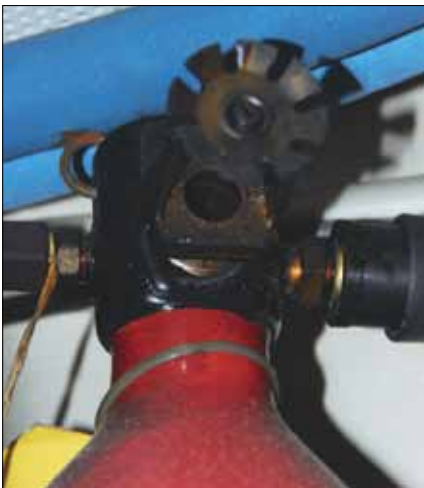
Above —Careful inspection of this FFE system revealed that it had been discharged for several years. Staff should be briefed to look for gross faults like that during casual inspections. Right —Those who work around an FFE system must understand how it functions and how it can be discharged. Locate it out of the way of regular traffic, but still accessible for regular inspections.

Because the automatic-discharge feature is triggered by heat, the nozzle