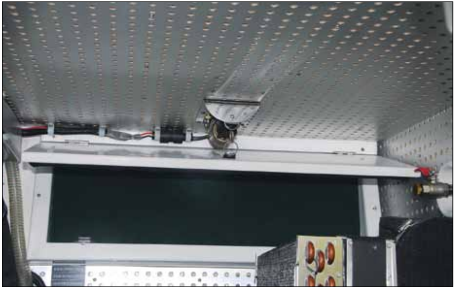
Passive engineroom air intakes are a source of oxygen for a fire. They too can be closed by relays in the automatic shutdown system to maximize the effectiveness of an FFE.

The same is true of forced-ventilation systems operating when the FFE system discharges. While ABYC guidelines call for installation of a placard at the helm alerting