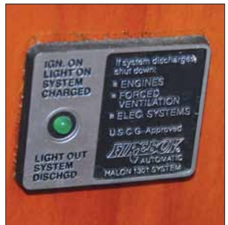
Left —Whenever possible, manual discharge handles should be installed in plain view. If one is placed in a locker, clearly label it to indicate its presence. Center —The exposed manual discharge handle is missing its arming pin. Right —Be certain you and your customer understand that the indicator light goes out once the system has discharged.