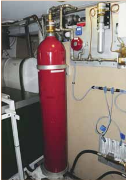
Left —Especially large FFE bottles should be located amidships and securely fastened to a bulkhead.

systems offer engineered systems as well.