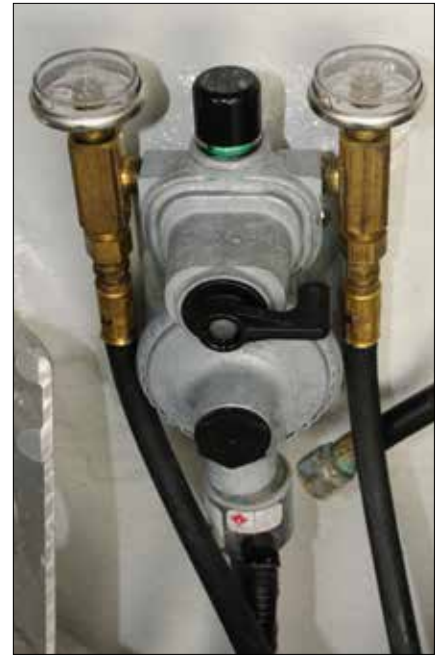
A combination regulator, solenoid, and distribution manifold. Each tank is equipped with its own gauge for leak detection of lines beginning at the tank's valve-to-hose connection.

It's worth noting that steel, aluminum, and composite cylinders of the