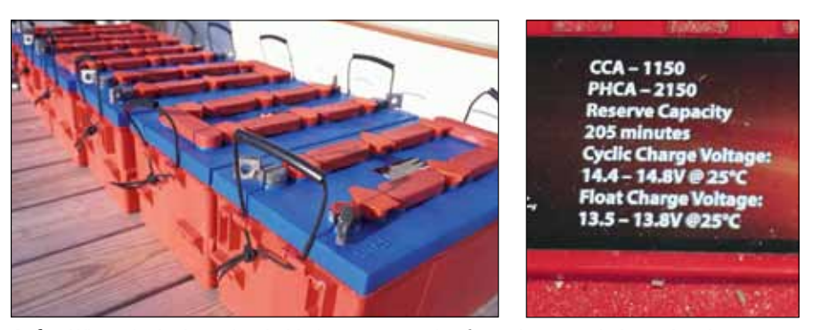
Left —When designing a bank, it's better to employ fewer larger style batteries than to a greater number of smaller case styles. This reduces the number of connections required, simplifying installation. Right —Battery specifications guide the user in building a bank of the correct amp-hour capacity as well as specifying proper over-current protection.

When assembling any battery bank, avoid mixing battery case sizes and ages. In theory, different case sizes present differing internal resistance even when new. These differences can push a bank into imbalance. The same is true of batteries as they age