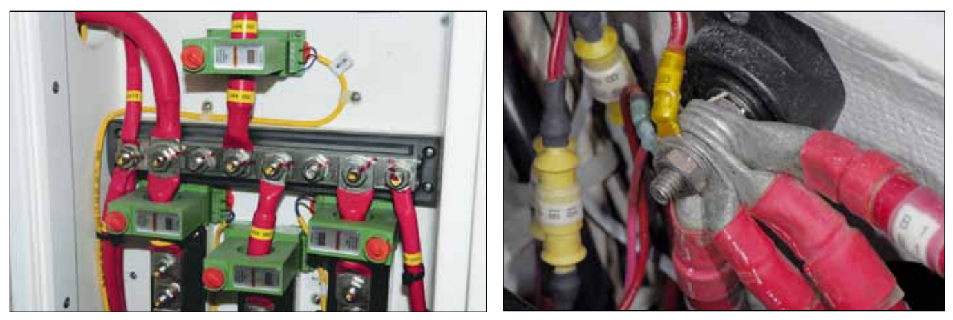
Left —Hall effect transducers are valuable sensors for multiple-battery installations. They allow a user to monitor the performance of an entire battery bank, a section of batteries within the group, or even an individual battery. Right —Stacked ring terminals, even within the ABYC specified limit of four, invites resistance and heat generation, putting an unnecessary drain on an otherwise properly designed bank. A bus bar would better serve this installation.

Make all connections direct, and avoid intervening hardware and components. Ring terminals should make direct contact with battery terminals.