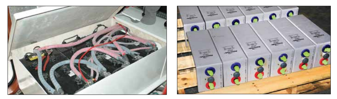
Left —Carefully install wiring for all battery banks, and mitigate the possibility of cable chafing. While the cables in this bank have been wrapped in an anti-chafe loom, its material is not ABYC compliant, because its design is discontinuous and lacks fire resistance. Right —Beyond a certain size threshold, 2V batteries wired in series make good sense because of their lighter weight, smaller size, and more manageable electrical output.

entire bank from the boat in the event of a fire or other malfunction. It should be readily accessible, preferably outside the engineroom.