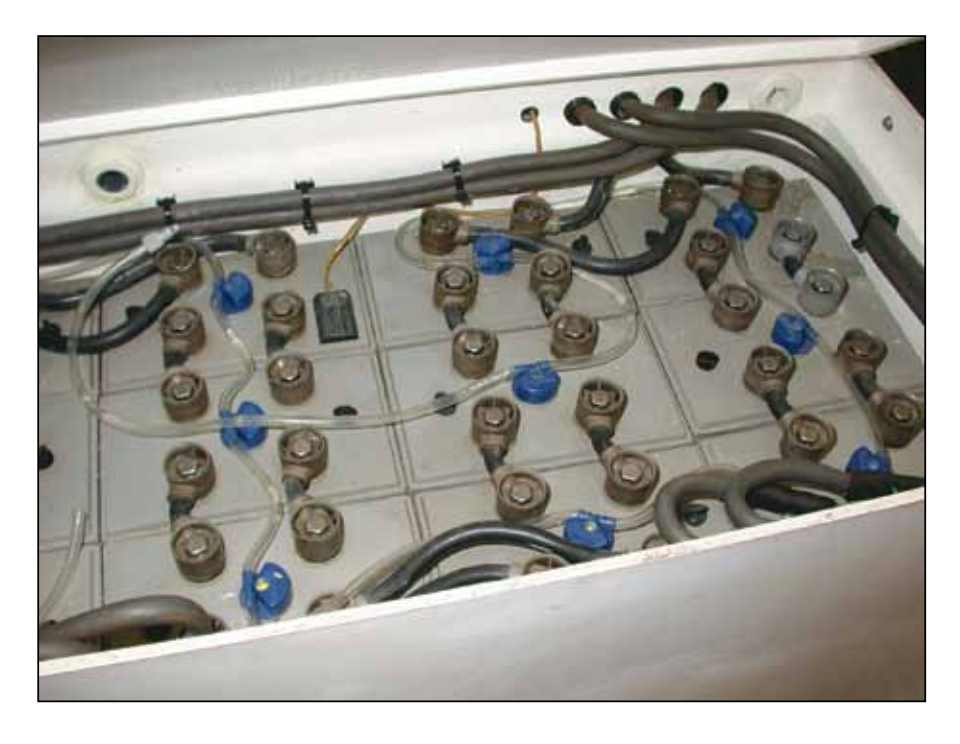
When you increase the size of a battery bank, the potential for faults and failures goes up accordingly. Because of the physical size and weight of the batteries, not to mention the electrical energy stored within large banks, failing to properly secure them and incorrectly routing cables can cause serious damage to a boat.

20¾ " x 10" x 10¼ " (52.7cm x 25.4cm x 26cm) and weighs 165 lbs (74 kg); or 500 Ah at 24V from four 8D batteries in a combination of series and parallel connections. My criteria have as much to do with the number of batteries in the house bank as with the amp-hour capacity or voltage. If smaller case sizes were applied to the above equations, the overall number of batteries and the complexity of a given system would consequently grow.