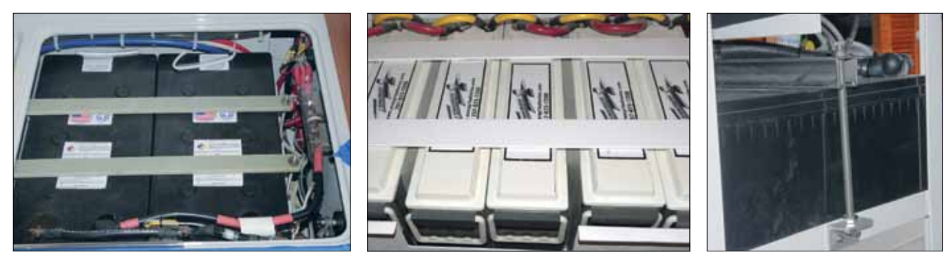
Making sure that batteries stay put when a boat is running in rough conditions or heeling excessively is critical for all battery banks, large or small. Because of their weight, large banks can test retainer designs. Many installers don't consider the need to balance retention and ventilation, but these three installations ensure that the batteries are secure and have adequate air circulation.