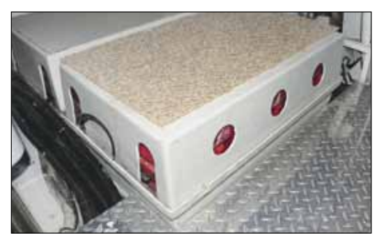
Battery boxes are ideal for securely retaining and protecting batteries and for containing spilled electrolyte. But boxes also present challenges. Chief among these is ventilation, which prevents hydrogen from being trapped within the box and allows heat to dissipate. These installations receive a failing grade because of inadequate ventilation.