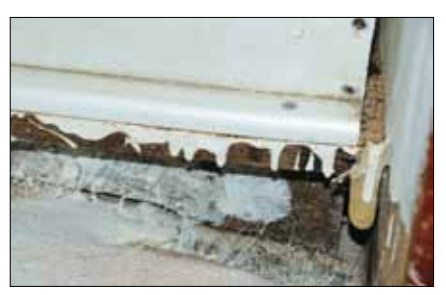
The base of this battery shelf lacks the necessary integrity to support the heft of this near 1,000-lb (454-kg) bank, and its unencapsulated timber will rot if routinely exposed to water.

So what constitutes "incidental"? If the battery is an SVRLA, does this guideline negate the need for containment? Does a flooded battery require 100% containment in a box? And just how much electrolyte is it reasonable to expect an installation to retain when a sailboat heels? I've been asked those questions by boatbuilders, professional systems installers, and boat owners. The answers are complex and remain debatable.