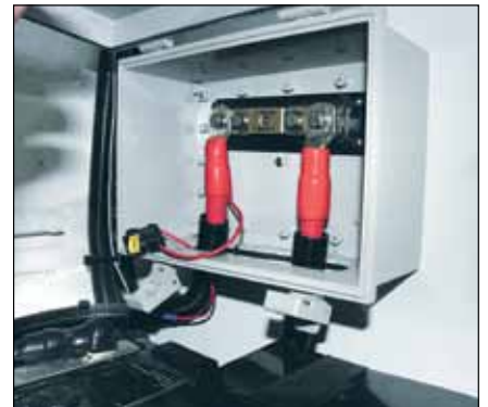
Left —Two parallel series strings of two batteries each allow for high amp-hour capacity at the desired 12V-system voltage. Above —Over-current protection of large battery banks is a critical requirement. Class T fuses are well suited for this role. The fuse shown here is an ANL, which lacks the appropriate ampere interrupt capacity for the large bank it serves.