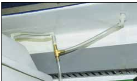
This battery box vent "system" is intended to remove hydrogen gas, but because it dips down, the fumes cannot properly escape. Water has accumulated in the dip, making gas passage even more difficult.

Make provisions for access when designing or installing large battery banks. Flooded batteries require regular access to inspect electrolyte level and add distilled water (batteries should be maintained with only pure distilled water). The electrolyte in a battery is a diluted mixture of sulfuric acid and water that should be filled no higher than the internal cell liquid-level indicator, typically a tab that protrudes down and into the cell.