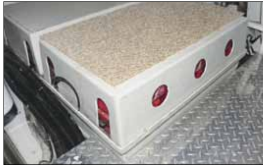
Battery boxes are ideal for securely retaining and protecting batteries and for containing spilled electrolyte. But boxes also present challenges. Chief among these is ventilation, which prevents hydrogen from being trapped within the box and allows heat to dissipate. These installations receive a failing grade because of inadequate ventilation.

Expect that during the life of a boat the SVRLA batteries might be replaced with conventional flooded batteries, making spilled or leaked electrolyte a possibility. I advise builders installing SVRLA batteries to consider such a retrofit in the boat's future, and include trays or liquid-tight cleat assemblies surrounding the batteries, and shelves that are impervious to degradation from exposure to electrolyte and water. These features should be robust enough to resist deformation and the possible failure of their acid-resistant encapsulation. Since resin alone lacks sufficient abrasion resistance for a reliable, long-lasting acid-proof coating, that means shelves of wood or synthetic core should be fully laminated with resin and glass fiber; and perimeter cleats should be secured to the shelf with fasteners and adhesives or epoxy bedding.