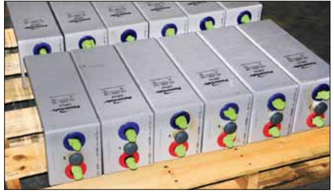
Left —Carefully install wiring for all battery banks, and mitigate the possibility of cable chafing. While the cables in this bank have been wrapped in an anti-chafe loom, its material is not ABYC compliant, because its design is discontinuous and lacks fire resistance. Right —Beyond a certain size threshold, 2V batteries wired in series make good sense because of their lighter weight, smaller size, and more manageable electrical output.

entire bank from the boat in the event of a fire or other malfunction. It should be readily accessible, preferably outside the engineroom.