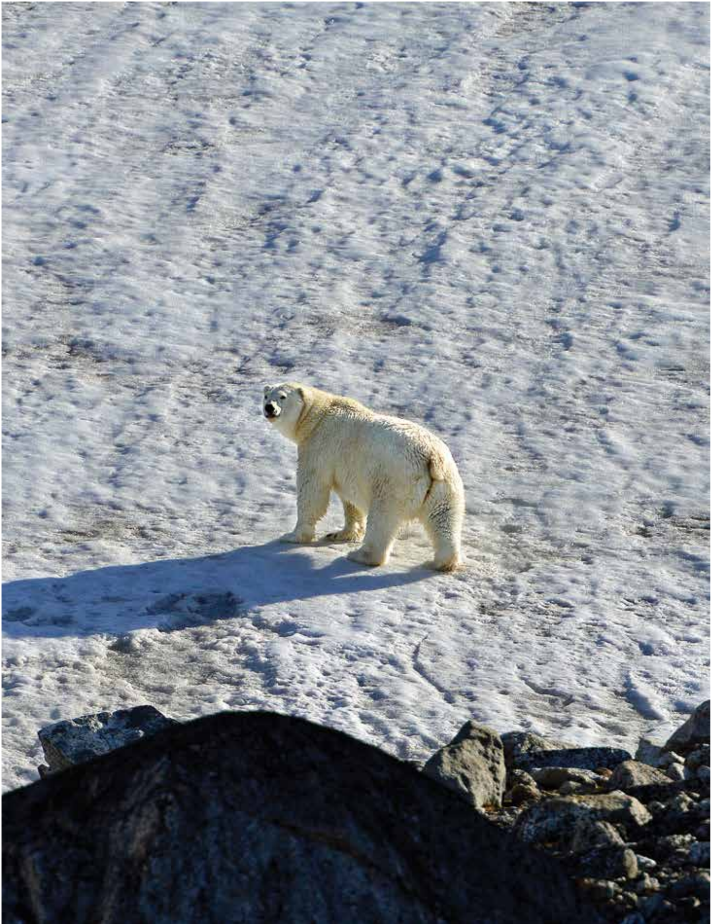
It's difficult to appreciate the grace and agility of a polar bear's moves until you've seen them. This bear is at the mouth of Sallyhamna fjord.