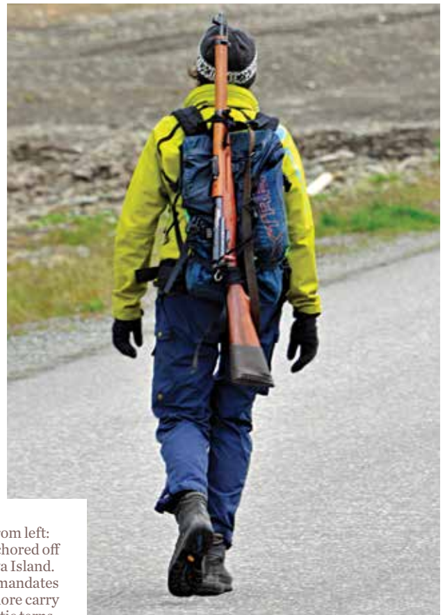
Clockwise from left: Migration anchored off Ammonittøya Island. Svalbard law mandates that those ashore carry firearms. Arctic terns are common here. A trappers' hut with polar bear damage. The colorfully painted buildings of Longyearbyen. This bust of Vladimir Lenin is in Pyramiden, a defunct mining town.