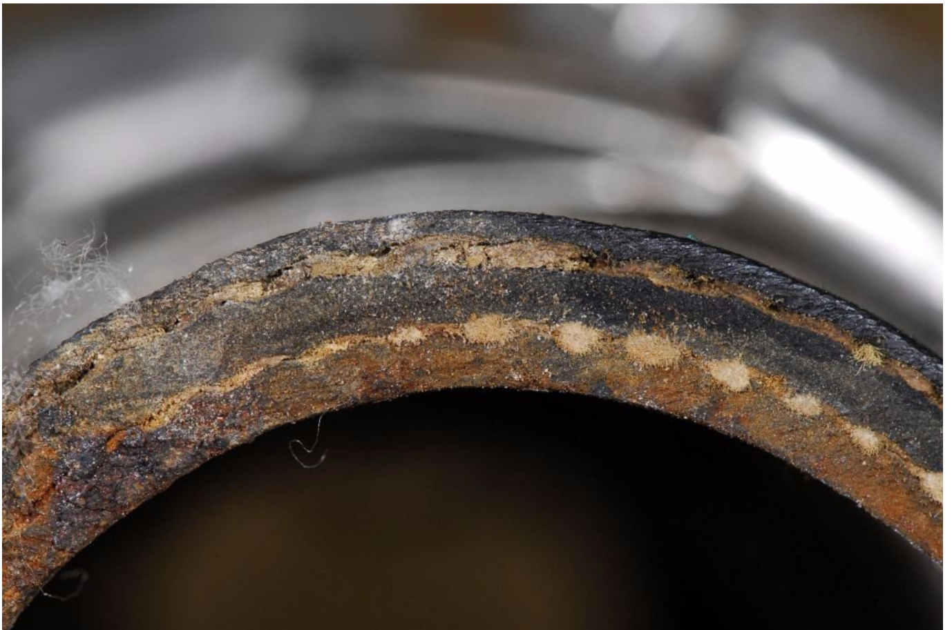
The five plies of a stuffing box hose (top) are clear to see,