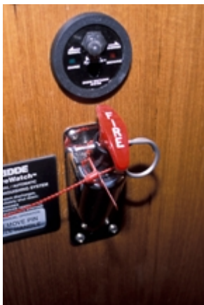
A manual T handle discharge along with the pilot light panel and override switch.

paperback book-sized black box with a number of wires attached to it. This is a worthwhile function because, unless it's installed, it's possible for this equipment to consume and exhaust the fire extinguishing agent, thereby limiting its effectiveness and possibly preventing it from smothering the fire. With the relay system, you don't have to remember to shut anything off, the system does it all for you automatically. By the way, if the pilot light is not on, then the system is either discharged, the circuit is not energized or there's an electrical fault in this circuit, all of which warrants immediate attention.