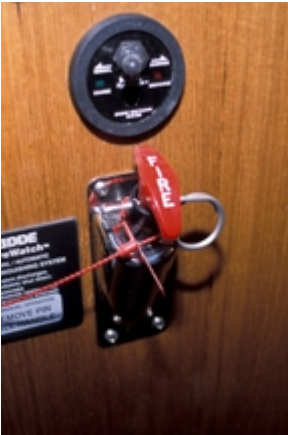
A manual T handle discharge along with the pilot light panel and override switch.

paperback book-sized black box with a number of wires attached to it. This is a worthwhile function because, unless it's installed, it's possible for this equipment to consume and exhaust the fire extinguishing agent, thereby limiting its effectiveness and possibly preventing it from smothering the fire. With the relay system, you don't have to remember to shut anything off, the system does it all for you automatically. By the way, if the pilot light is not on, then the system is either discharged, the circuit is not energized or there's an electrical fault in this circuit, all of which warrants immediate attention.