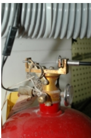
A manual T handle discharge along with the pilot light panel and override switch.