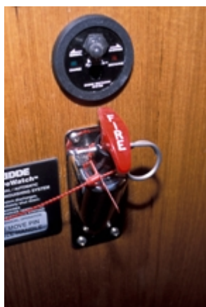
A manual T handle discharge along with the pilot light panel and override switch.

paperback book-sized black box with a number of wires attached to it. This is a worthwhile function because, unless it's installed, it's possible for this equipment to consume and exhaust the fire extinguishing agent, thereby limiting its effectiveness and possibly preventing it from smothering the fire. With the relay system, you don't have to remember to shut anything off, the system does it all for you automatically. By the way, if the pilot light is not on, then the system is either discharged, the circuit is not energized or there's an electrical fault in this circuit, all of which warrants immediate attention.