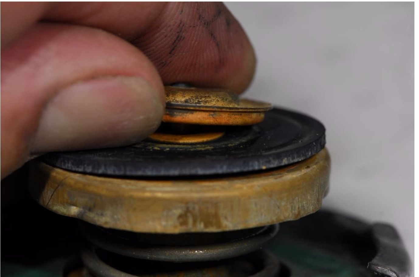
Pressure caps are comprised of several parts, including