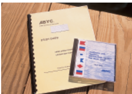
The range of publications produced by ABYC is broad, indeed, including everything from the all-inclusive Standards and Recommended Practices for Small Craft , shown here in CD form, to study guides for certification exams.

With the increased implementation of American Boat and Yacht Council standards, this scenario is no longer as uncommon as it once was. If this happens to you, you may, no doubt, be as chagrined as Cherokee's skipper was when he learned about his vessel's deficiencies. You might even wonder if,