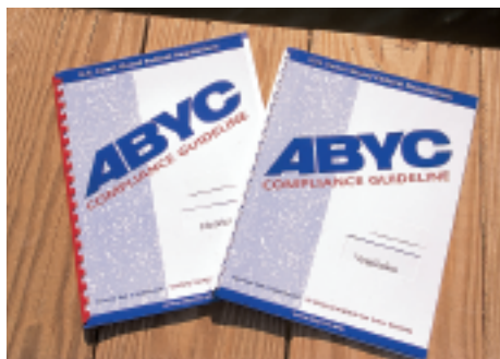
ABYC offers several reprints of Coast Guard requirements on topics from electrical and fuel systems to ventilation and floatation requirements.

ABYC was formed during the recreational boating industry's exponential growth of the 1950s. Fiberglass was a revolutionary product in this day; most boats were still built using timber, caulk and enamel paint. In 1950, members of the Motorboat and Yacht Advisory Panel of the U.S. Coast Guard's Merchant Marine Council were tasked with creating an organization that would provide boatbuilders, equipment manufacturers and repair yards with critical safety related information. With this mandate, the American Boat and Yacht Council was born, convening its first meeting at New York City's Lexington Hotel in April 1954. Forty-three members were in attendance—the founding fathers of ABYC, as they were, led by the organization's first president, Phelps Ingersol of Wilcox Crittenden Corp., a well known manufacturer of marine sanitation devices, seacocks and other shipboard gear.